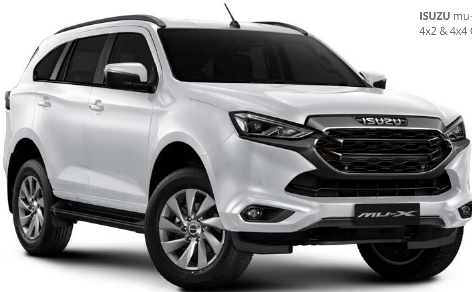
ISUZU mu-X 1.9 4x2 and 3.0 LS 4x2 & 4x4 Colour: SPLASH WHITE